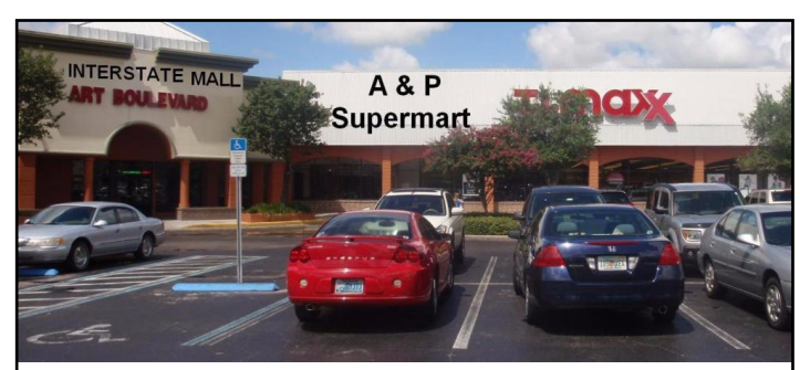
The Mall structure was still there, but the entrance led to what was now a mere corridor leading to cheap dollar movie houses, shown below left. On the right below was what had been our store years ago. It was now an art store in liquidation. The black lettering on the facade in photo is what I superimposed to show what it had been then; as A&P brought vivid memories.

From Palm Coast last week, we made that side trip to Orlando to meet with two 1959 high school classmates, Nito and Edlin of Crystal River. The halfway point was Orlando. And Altamonte Springs was on the way. They had invited us to overnight with them and go fishing in Nito's yacht. But we were short on time as our hosts also had lined up lots of social activities with all their friends.