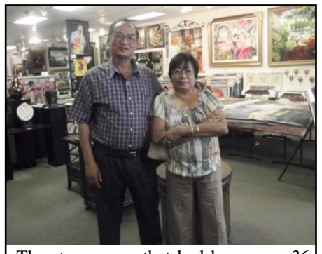
The store space that had been ours 36 years ago. Didn't seem to have changed.

Within 2 days after I arrived in 1974, there was a holdup at the adjoining A&P grocery. The cops came in with their guns drawn and there was a shootout. I saw one of the dead robbers sprawled on the floor, and I snapped pictures, then called the local